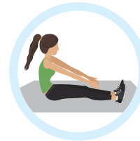
Seated Hamstring Stretch